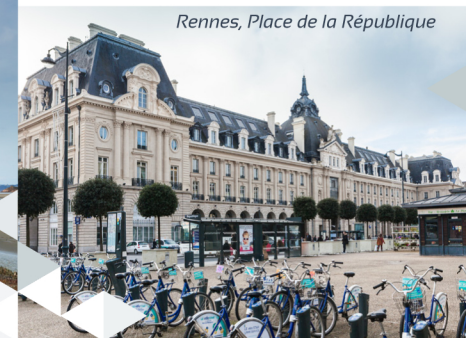
Rennes, Place de la République