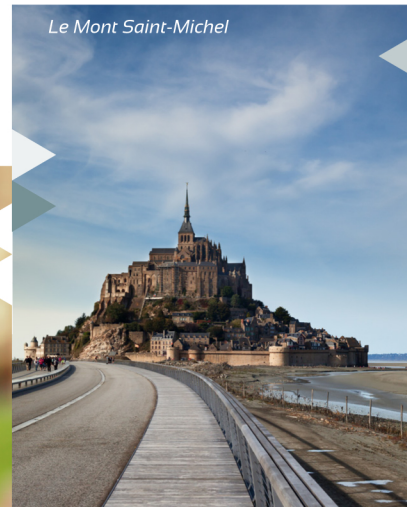
Le Mont Saint-Michel